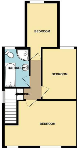
1ST FLOOR 455 sq.ft. (42.3 sq.m.) approx.